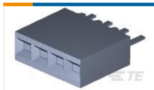
TE Part # 5-534237-2 04 MODII VRT SR CE 100/115