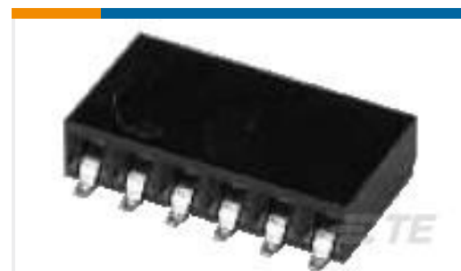
TE Part # 5147721-3 04 MODII HORZ SR SFMNT 30AU